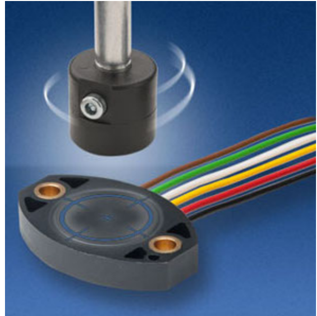
Novotechnik rotary position sensor with magnetic marker

An electronic function can be turned on that will monitor and signal if the magnet is 'lost' as well as validate other functionality of the sensor.