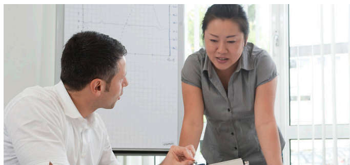
If necessary, we develop individual solutions together with our customer.s

Numerous manufacturers of mobile machinery, for example in the agricultural and construction machinery industry are relying on linear and rotary sensors from Novotechnik.